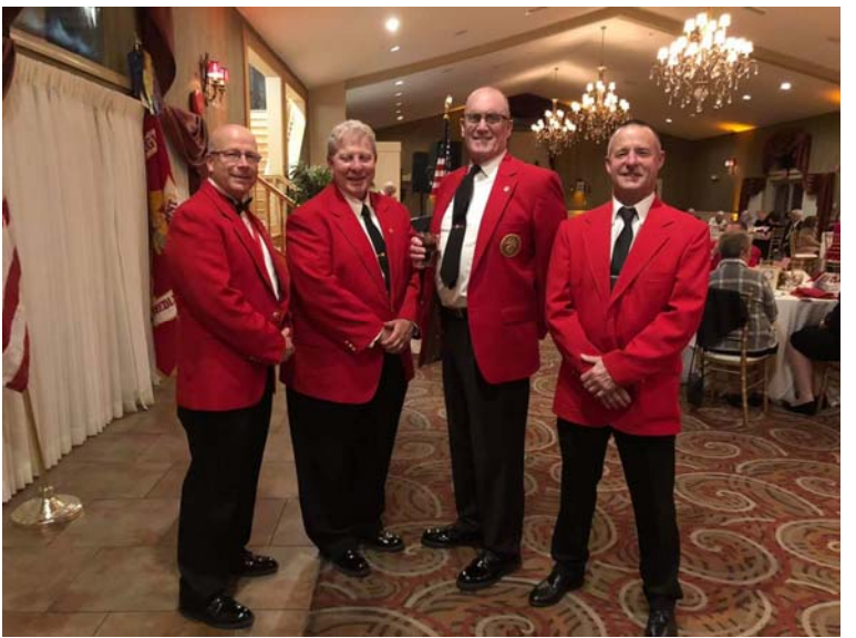
Detachment Marine Corps Birthday Ball