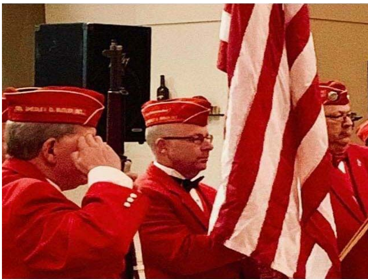
Detachment Marine Corps Birthday Ball