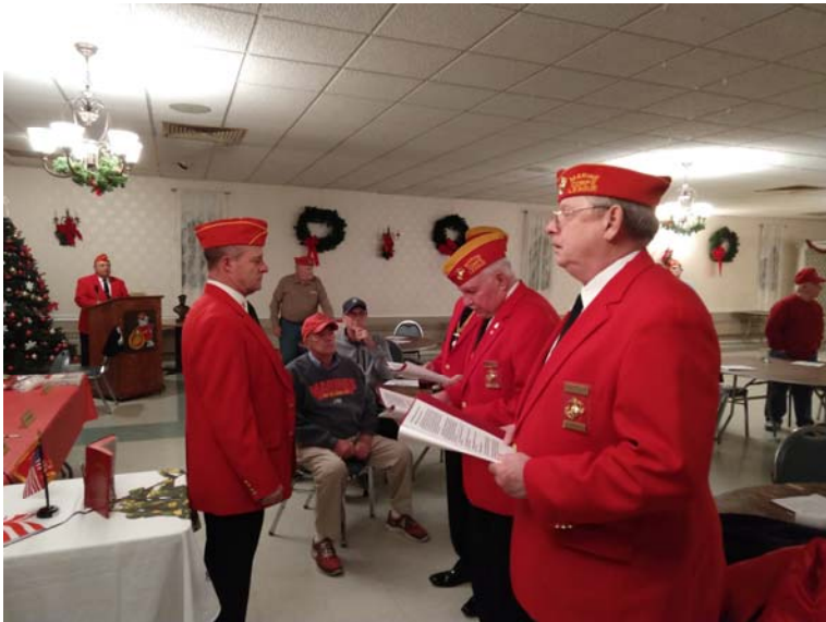
Swearing in Ceremony