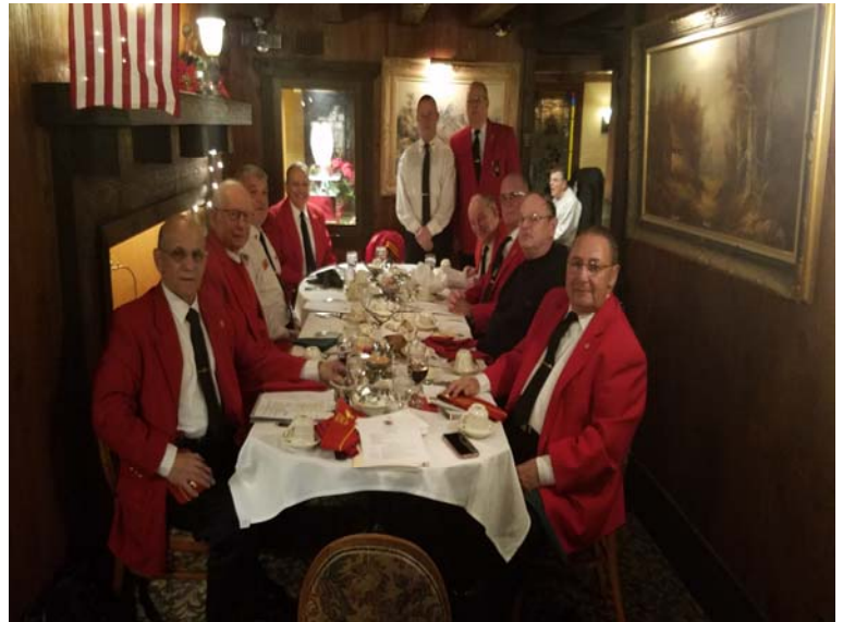
Annual Staff Meeting Diner