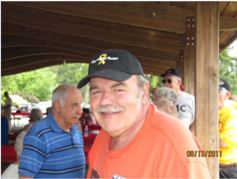
Combined Veterans Alliance 2011 Picnic