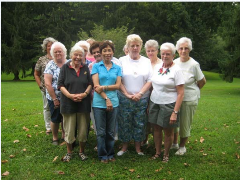
Combined Veterans Alliance 2011 Picnic