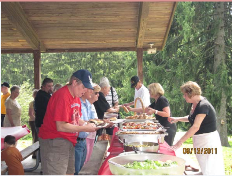
Combined Veterans Alliance 2011 Picnic