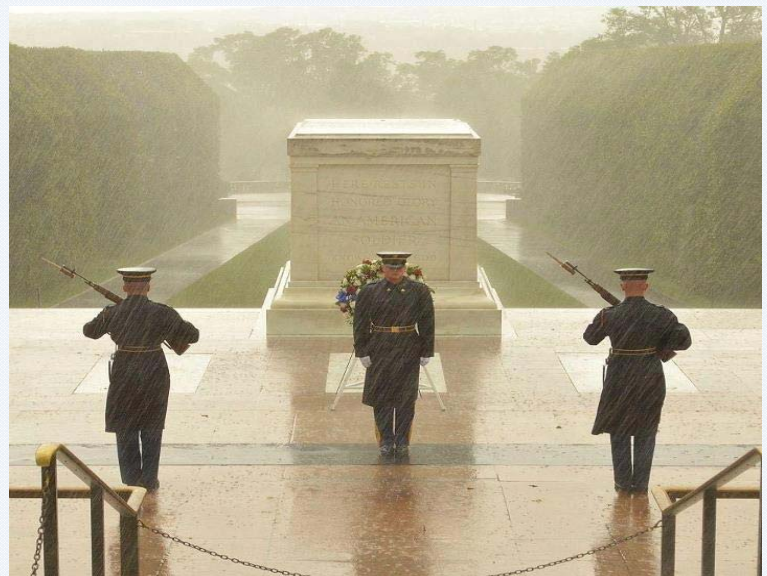
Guarding the Tomb through Hurricane Sandy