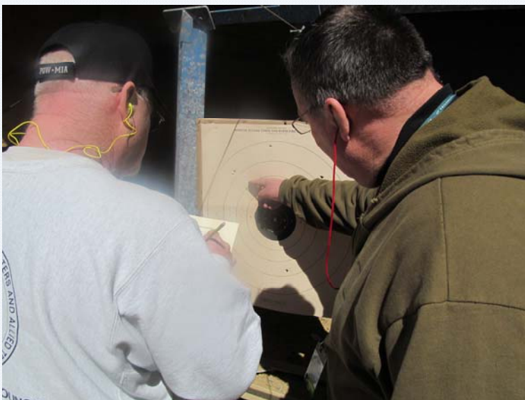
Another pistol match photo