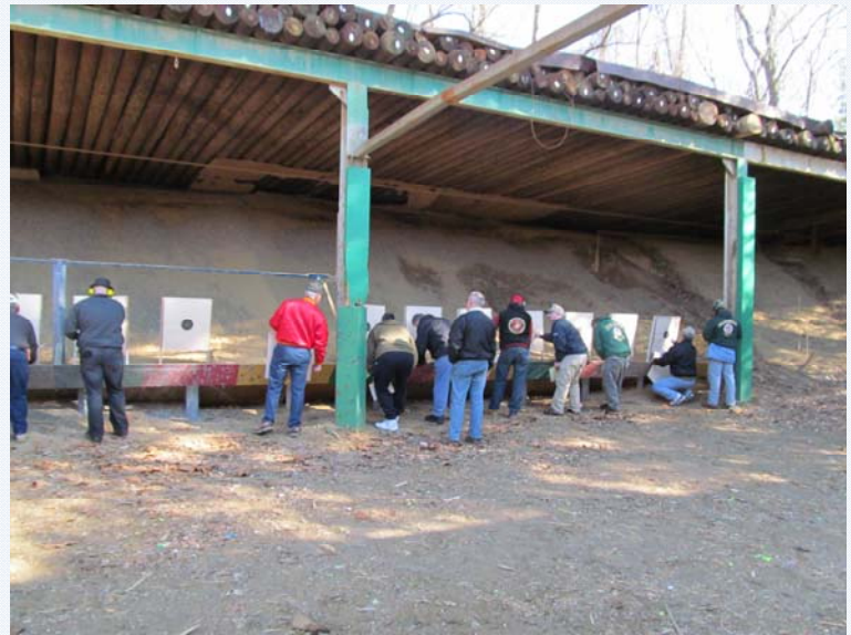
Some photos from the area pistol match that took place in March