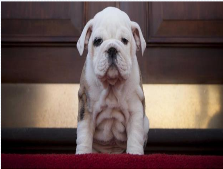
Chesty XIV has arrived in Quantico & will replace Sgt. Chesty XIII