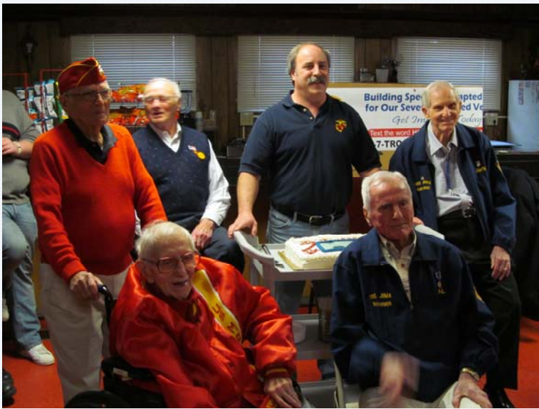
Annual ceremony honoring our local Iwo Vets