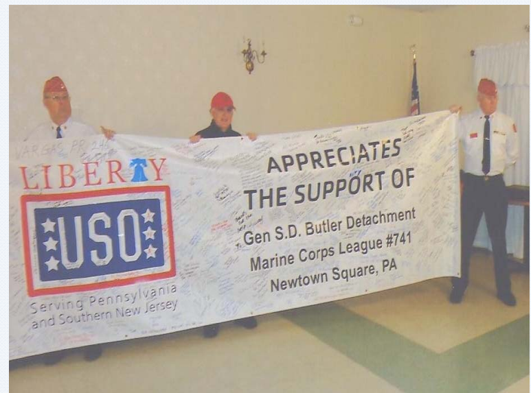
Banner from Phila International is presented to Detachment