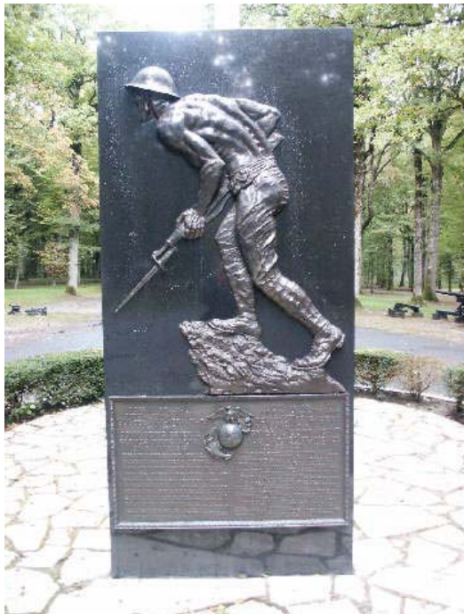
Belleau Wood Memorial

Next Meeting June 4, 2012 *1800 hours Knights of Columbus 327 N. Newtown Street Rd. (Route 252) Newtown Square, PA 19073