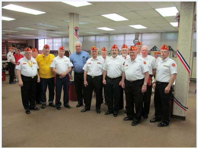
District One Meeting hosted by Chester County Detachment