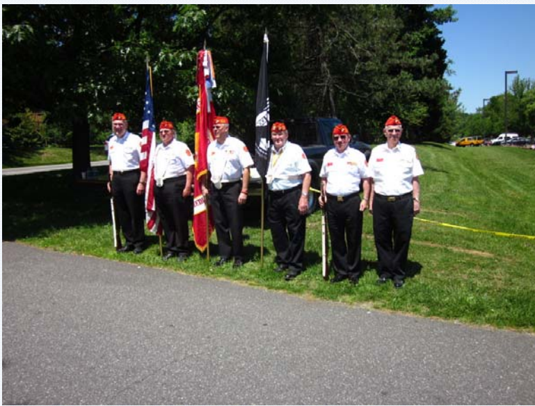
Color Guard at the Walk for the Wounded event