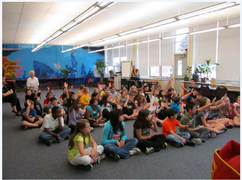
Students at the Russell School in Bromall take in our Americanism Program