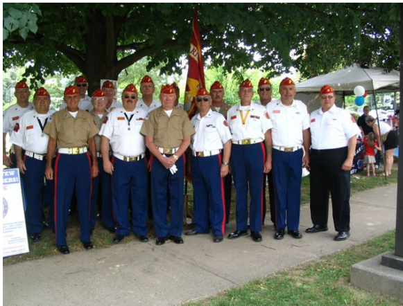
The Delaware County, General Smedley D. Butler, and Upper Darby Detachments show their cohesiveness at Rose Tree Park on Fathers' Day Sunday, where the “Walk For The Wounded” was started with their respective Color Guards.