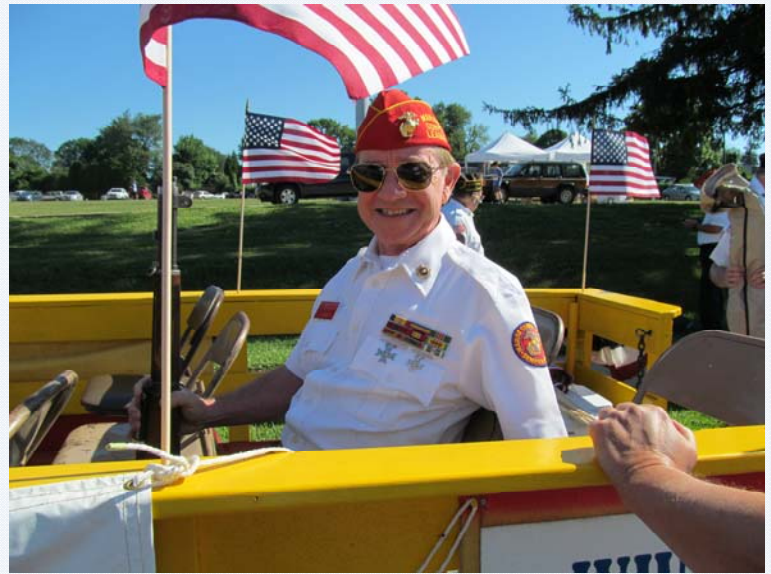
Annual Independence Day Parade