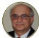
RALPH GALATI United States Air Force Captain, O-3 Cold War & Vietnam War Prisoner Of War