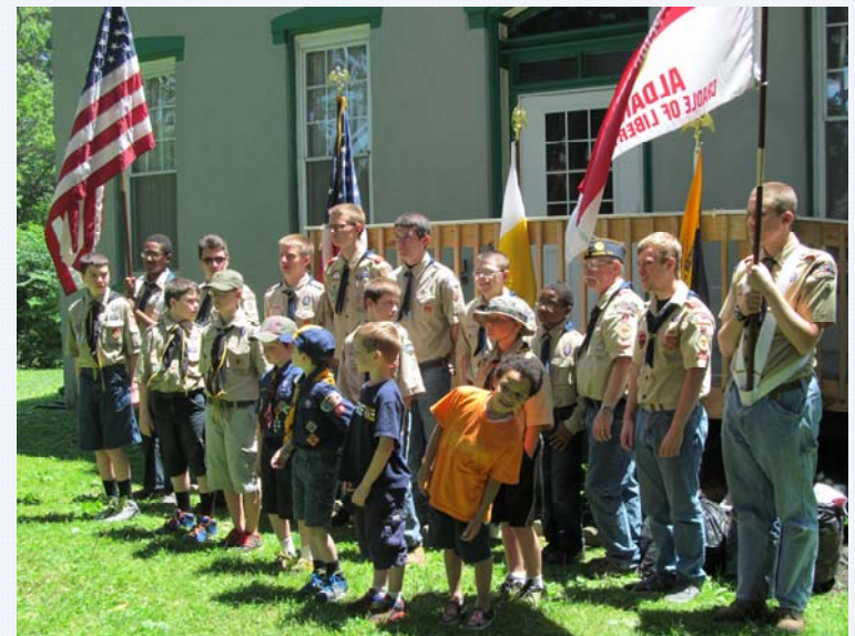
Flag Retirement Ceremony at the Upper Darby Det. Home in cooperation with Butler Det., Aldan American Legion and Boy Scouts