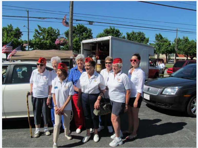
Annual Independence Day Parade