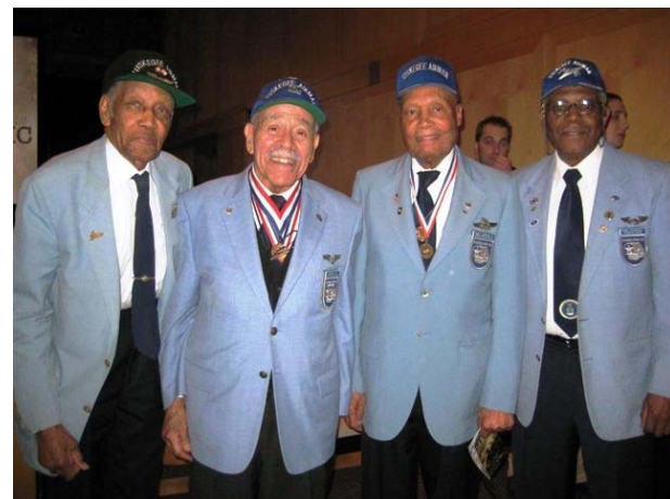
Members of the "Tuskegee Airmen"